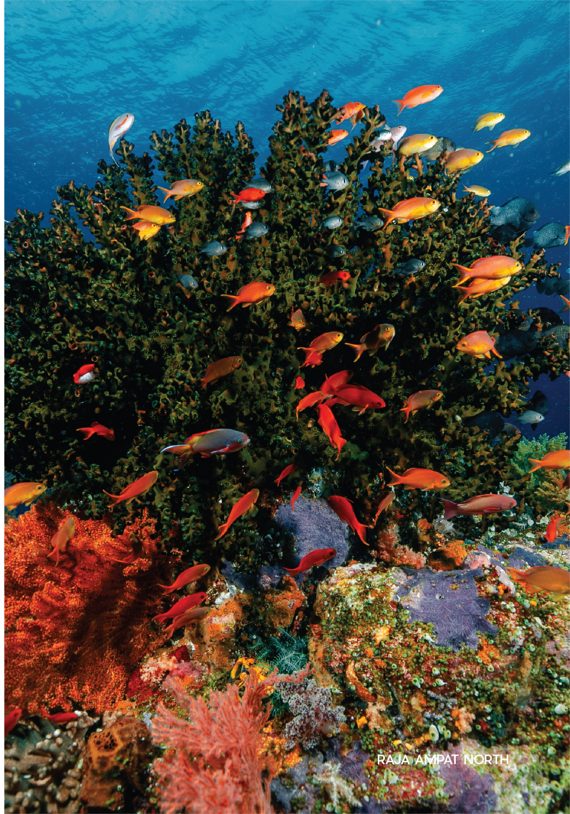
RAJA AMPAT NORTH

After lunch, we will head to Wofoh North for a relaxing dive. Here, we will explore the sloping reefs covered with healthy coral gardens and teeming with schools of fish. The calm waters and striking beauty of this site make it the perfect way to end your diving adventure for the day.