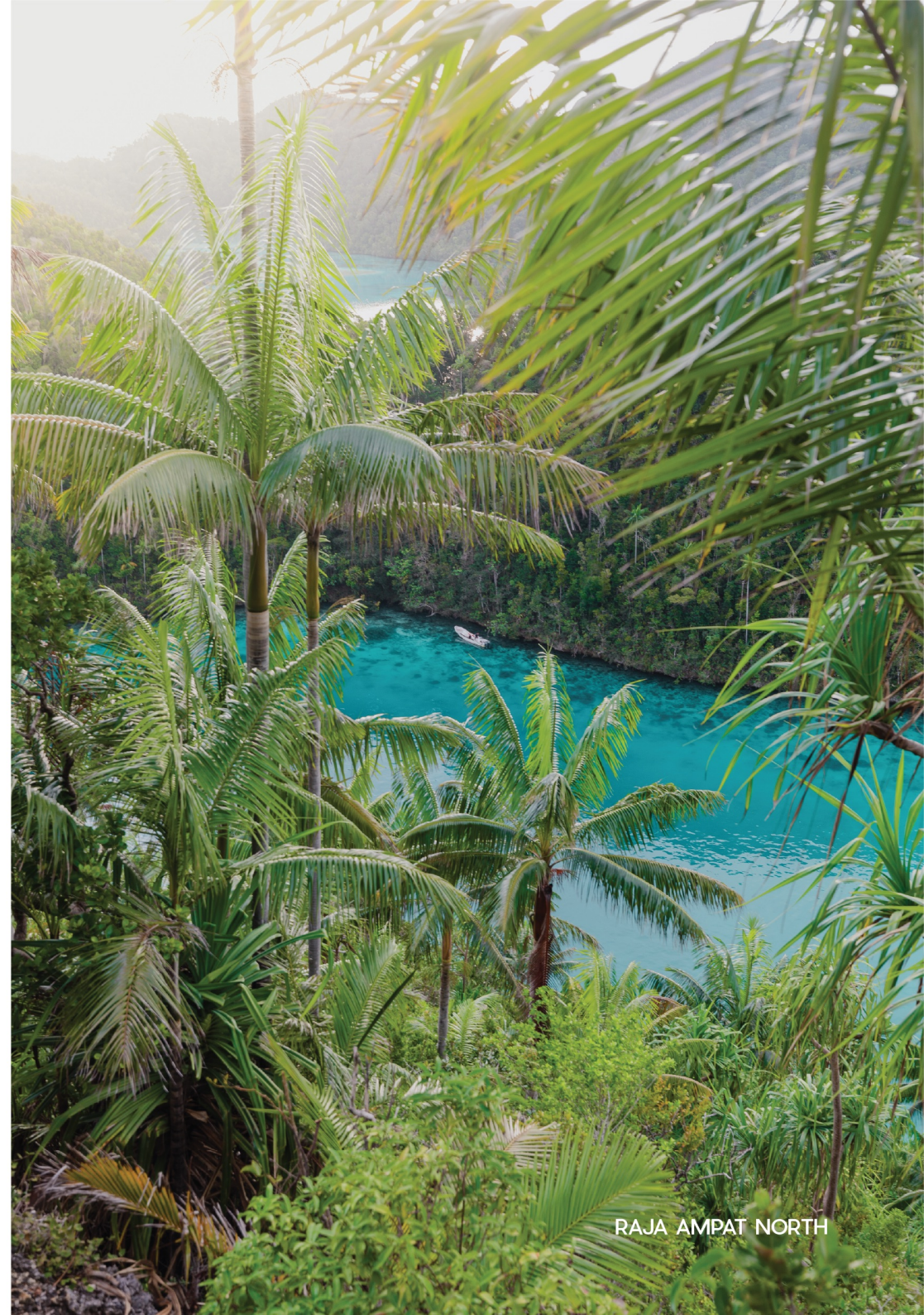
RAJA AMPAT NORTH

*La Galigo does not guarantee this outlined itinerary, and it is to be considered as a rough guideline. Information compiled here is based on past trips we have conducted and includes common dive sites and routes we often visit. Weather and sea conditions in the area can be unpredictable, and La Galigo retains the right to alter an itinerary from the advice of the ship's captain, cruise director, or owner for the safety of the vessel, its passengers, and crew.