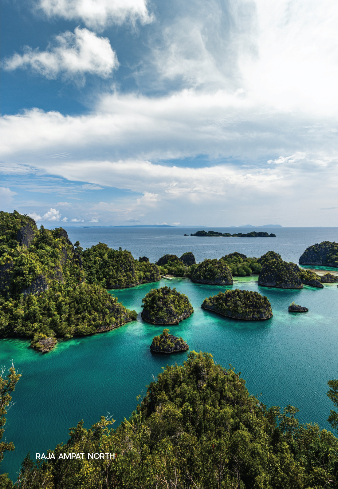
RAJA AMPAT NORTH